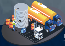
Hazardous Material Transportation