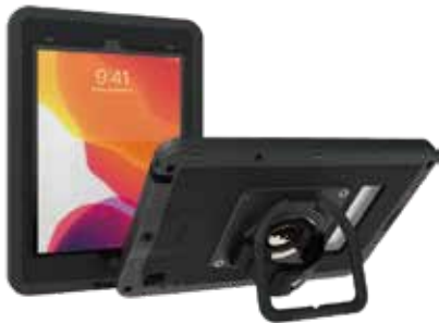
CWA647MP for iPad 10.2"