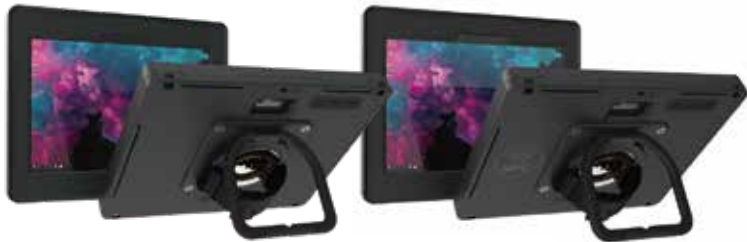
CWM417MP for Surface Go 3